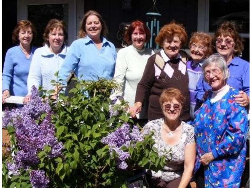
British Women of Cambria, California

The British Women living in Cambria , California give their knitting. They have given hand knit hats, mittens, scarves, and sweaters to the children of Casa Mea and to many other children throughout the world. They give a very unique gift of themselves!