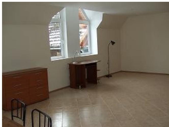
New apartment for long term volunteers

For the time being, this concludes the renovations to the main house. As the children grow and need more space, we will eventually complete the renovations to the attic.