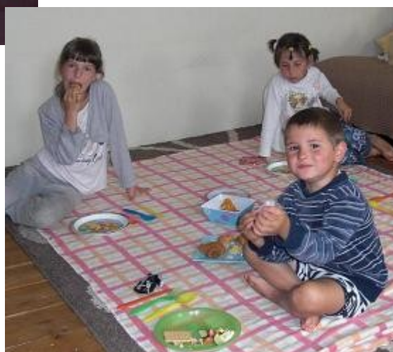
The children enjoyed an In door picnic