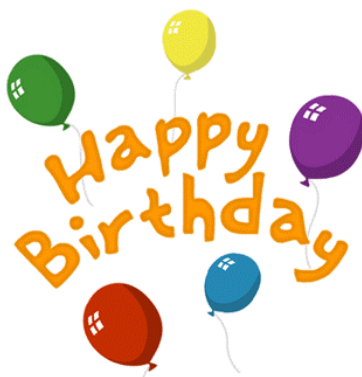
Amalia is ready to blow the candles!