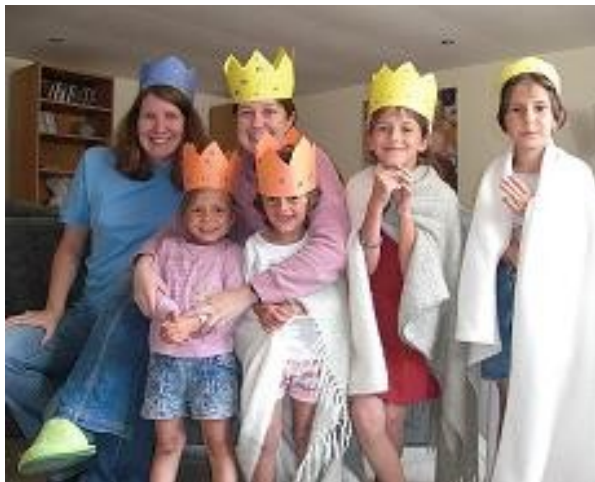
The girls were Princesses for a day

The children experienced a slumber party in the bunk house, being princesses for a day, a play-dough picnic, an excursion to Brasov for a Happy Meal at McDonalds, an indoor picnic, and a chance to wear a real bicycle helmet.