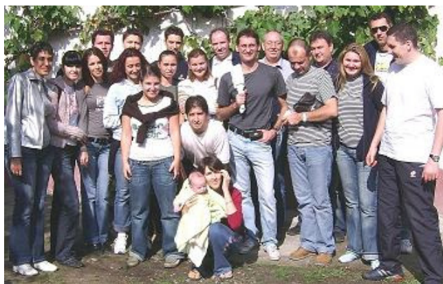
Petrom Construction Team

The Marketing/Comercial Division Petrom S.A. , a Romanian company, has supported Casa Mea since 2005, beginning with a very generous financial donation. Last year, they came to Prejmer for a day of hard work painting bedroom floors and cleaning up the courtyard. The group has also donated brooms, mops, clothespins, an ironing board, and many other practical items needed to set up a house, which quickly add up. Thank you, Petrom – all of us at Casa Mea appreciate your continuing interest and support!