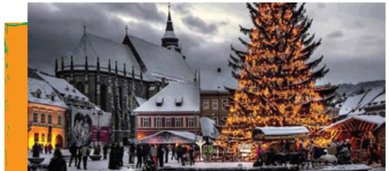
Christmas market in Brasov

A favorite winter activity is to visit the square in Brasov. There are many lights and stalls where people can purchase gifts or snacks. It is always a festive opening to the holiday season.