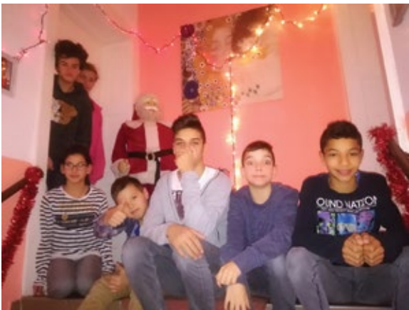
St. Nicholas arrived on December 6th

On December 6th St Nicholas visits all the children. Before bed, the children put their shoes out. If they have been good, they awake to a gift in their shoes. If they have been bad, they get a lump of coal. Thankfully, this year all the children received a gift from St. Nicholas!