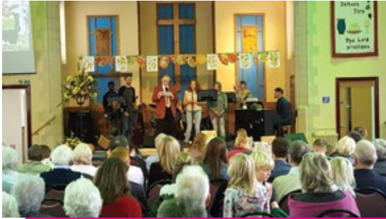
Emmanuel Baptist Church