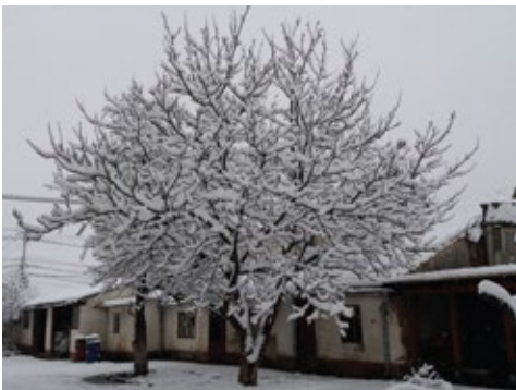
The first snowfall at Casa Mea

And of course, the excitement of the first snowfall is not lost on the children or the adults!