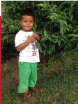
Olfris Nov. 9, 2016