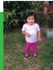
Margori, Nov. 11, 2016