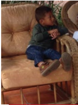
Olfris Sept. 9, 2016