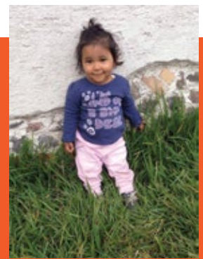
Yaidelin Nov. 10, 2016