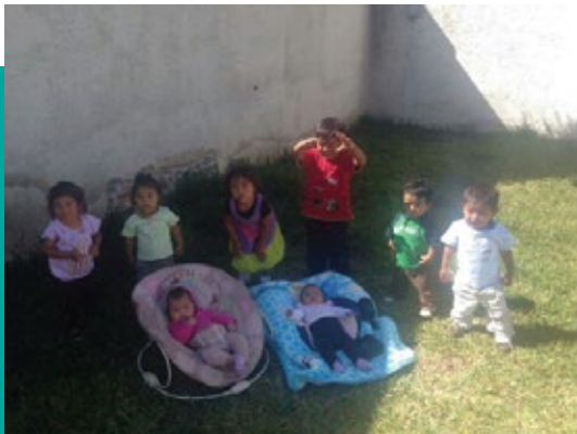
Our Mi Casita Children

Hopefully, with your donations, we can once again open our doors to 4 more abandoned children!