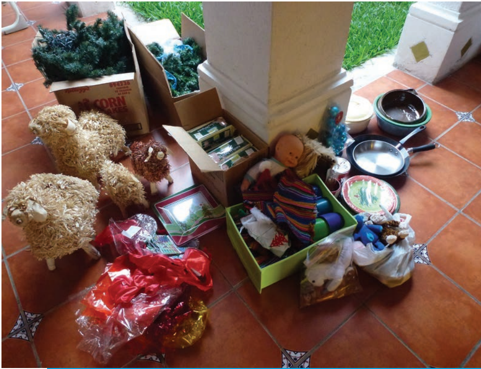
Canadian's Donations For Guatemala