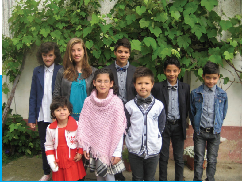
All the Children at Casa Mea