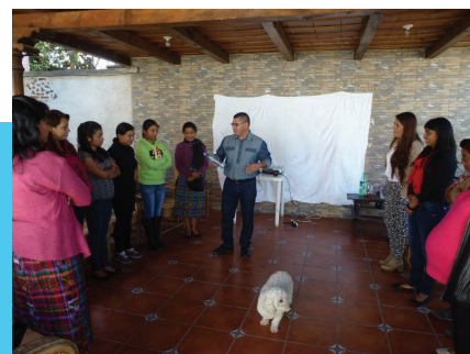
Training Staff In Guatemala