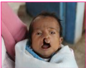
A baby awaits a home in Guatemala