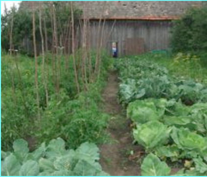
The garden is in full bloom this summer

Summer isn't all swimming pools and play time. The children also help in the garden. They shell the peas, weed, and pick the lettuce and spinach. Our beautiful garden provides all of us with plentiful and healthy vegetables for most of the winter months.