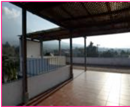
The home's rooftop terrace overlooks a volcano

I subsequently lived here for one year and spent all my holidays here. Last year I had decided to move to Antigua when suddenly I discovered that Mi Casita needed an administrator. Within two months I sold all my possessions and moved here in December of 2013. The government papers were supposed to be all ready for the children to move into Mi Casita's home. However, due to many circumstances, I had to start all over with almost everything, including the paperwork and moving into a new home for the children. I have found a beautiful house, which is very spacious with 5 bedrooms and baths. It is bright with a nice big patio and play area for the children and a rooftop terrace where you can enjoy the vista of all the volcanoes surrounding San Pedro.