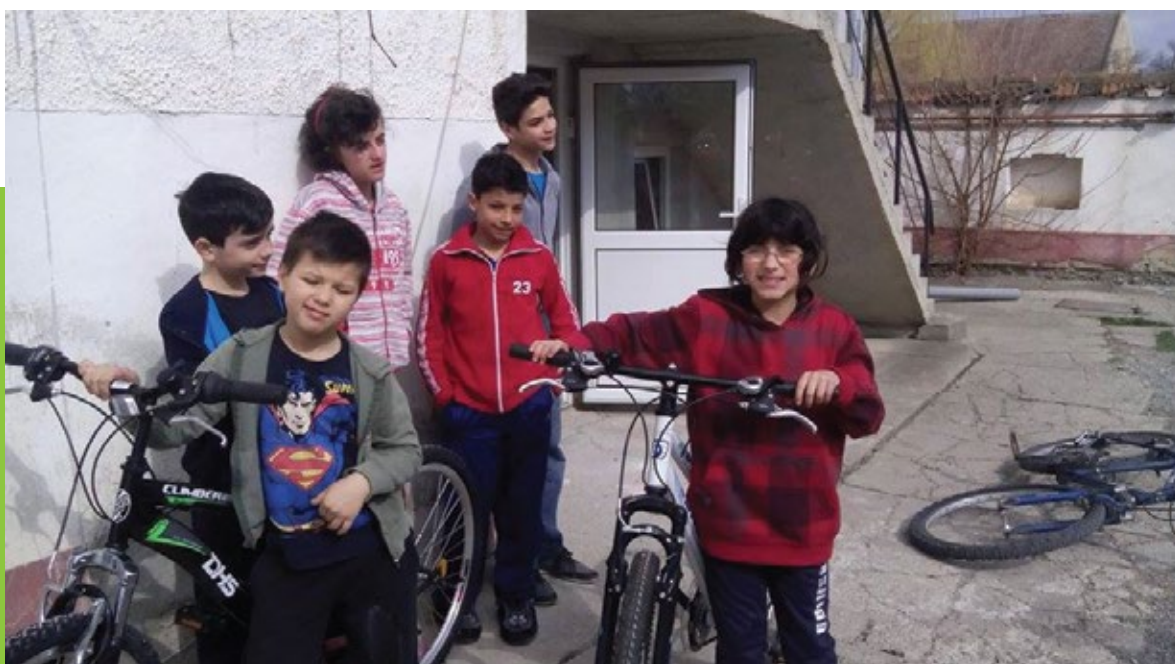
NEW BIKES FROM DENMARK