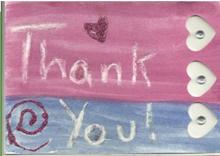
CHILDREN'S THANK YOU