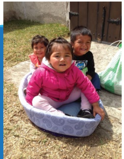
Fun in a "Boat"

consistently supported us at Mi Casita, we are grateful and hope that you will continue to support our older children at Casa Mea in Romania. Thank you all for your love and support while we have tried to get Mi Casita operational these past three years.