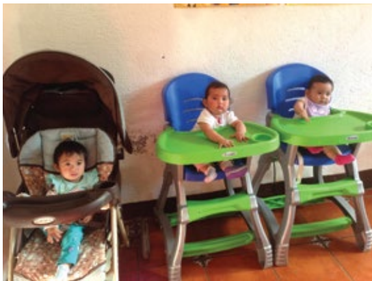
Some Mi Casita Girls