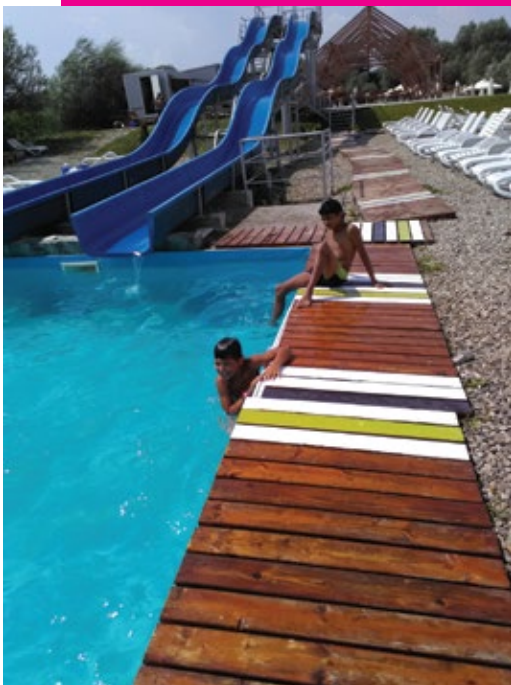
Summer Pool Party

all the children participated in the EU sponsored summer program in Prejmer, earning summer diplomas. Plus they all participated in the activities the volunteers planned and directed.