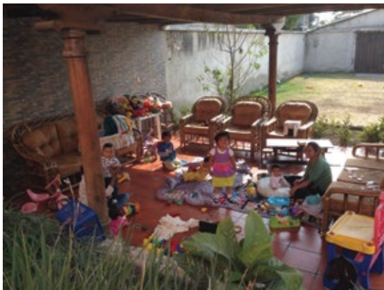
An Ordinary Day at Mi Casita

Due to lack of adequate funding, Mi Casita can no longer financially support its operations. Currently, we are in the process of placing our children in other homes or orphanages and letting our staff go.