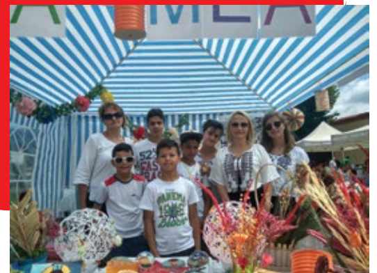
Summer Festival in Prejmer