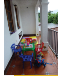
Mi Casita's house is ready!

now wait for our certificate to bring abandoned children into our home. We had hoped that we would have at least one child by Christmas but the government does not move that quickly! We are so grateful though that our house has passed its inspection. All thanks to YOU!