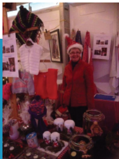
Christmas market in the NL