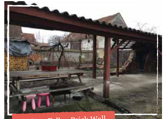
Before: Fallen Brick Wall