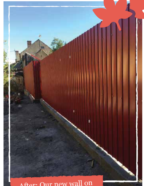
After: Our new wall on a brick foundation