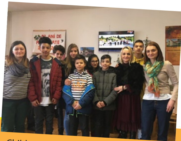
Children at the Home for the Elderly