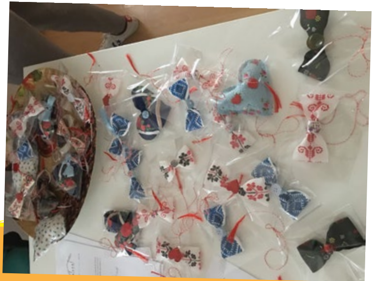
Martisor gifts made by the children

In addition to making Martisor gifts for their friends and teachers, on Martisor the children visited The Home for the Elderly in Brasov. They brought fresh flowers and their homemade Martisor gifts for the residents. The children wanted to show that these people should not be forgotten and needed hope of the coming spring too!