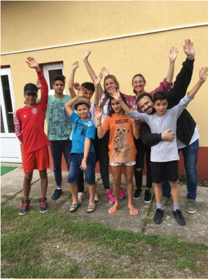
Children with Turkish Volunteers