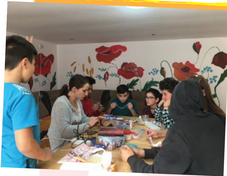
Children making Martisor gifts