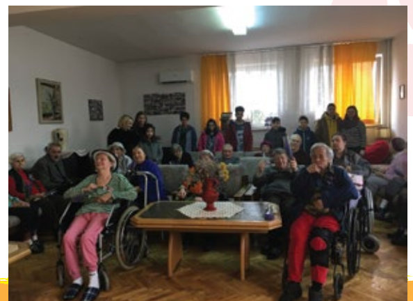
Both the children and elderly enjoying the Martisor tradition