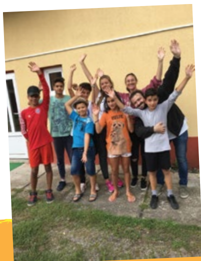
Turkish volunteers with children