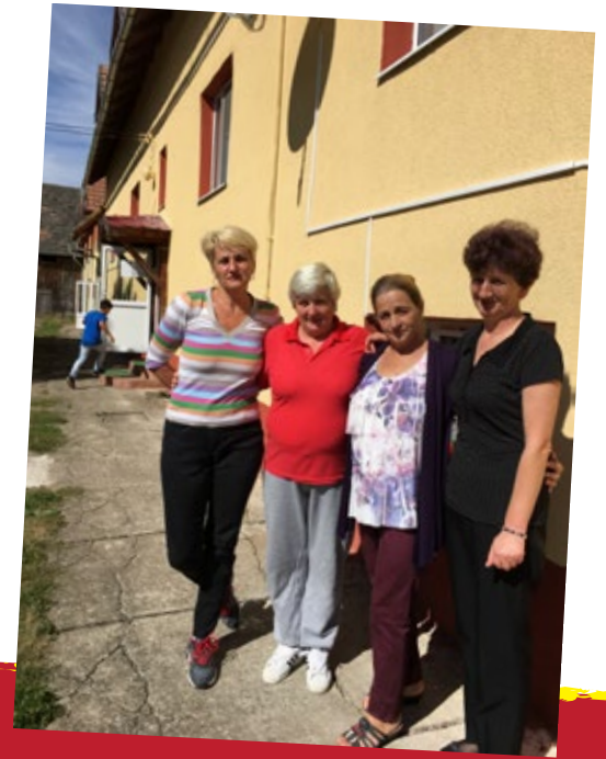
Picture of staff