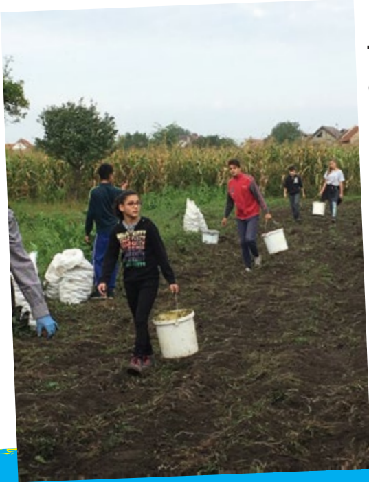
All the children help dig up potatoes

The kids all help with harvesting the bounty from our garden.