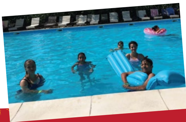
Kids enjoying a hot summer day at the pool

Thanks to our donor Anca, the kids enjoyed three days of swimming at the pool this summer!